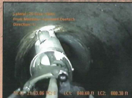
Lateral Inspection - a smaller camera is deployed from the main line unit into the service leads flowing into the main sewer line