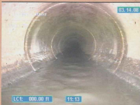
CCTV video inspection