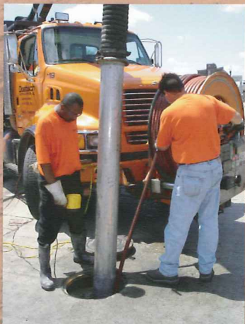
Conventional sewer cleaning