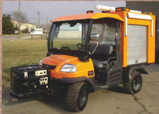
Dedicated off-road inspection vehicles