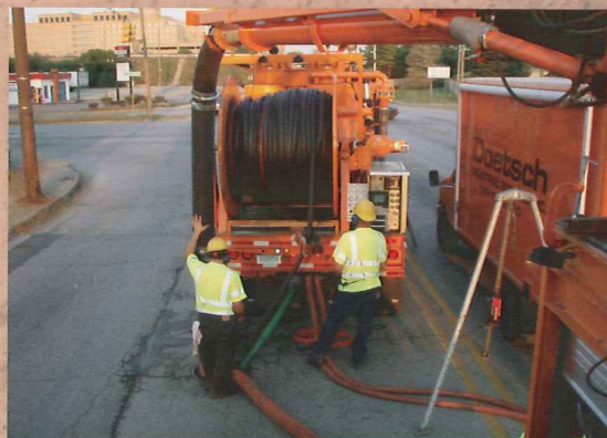
Large Diameter sewer cleaning